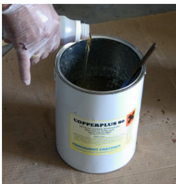
First add all of the hardener to the resin and stir.

Check the finished surface of the SAFEGUARD and remove any pimples caused by dirt with sandpaper. This is important because the COPPERPLUS on high spots will be worn away during burnishing and the coating damaged. If the SAFEGUARD PS has been allowed to cure for more than the time shown on the over-coating table, abrade with wet & dry paper to provide a key and re-apply.