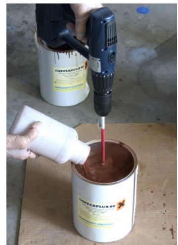
Then add all of the copper and continue mixing until smooth.

MIXING Small packs of COPPERPLUS are easy to mix using a flat stick about 20 mm wide, but larger packs are easier to mix with a small mixer used in a cordless drill. Add all of the hardener to the resin and stir thoroughly. Add all of the copper powder slowly while stirring, continue stirring until a smooth lump free paint with a creamy consistency is obtained. A small amount of SYNTAC solvent may be required in cold weather to enable the COPPERPLUS to flow to a smooth finish. Excessive amounts of solvent should not be used because it will cause the copper powder to settle out.