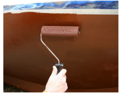
Copperplus is easy to apply with a short pile roller.

ROLLER APPLICATION We recommend the use of 6in or 7in (150 mm or 175 mm) short pile simulated mohair rollers of 1½” or 1¾” diameter. Two coats of COPPERPLUS should be applied to ensure even coverage. Ensure that the sufficient solvent has been added to provide a smooth finish. The use of too little solvent will produce a rough textured finish. A smooth finish is essential to ensure that the coating is self-cleaning.